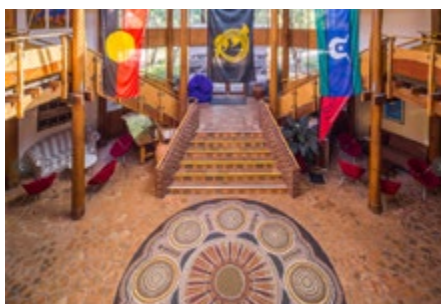
Centre for Aboriginal Studies at Curtin University

AGW would like to acknowledge the Indigenous Australians as the traditional custodians of the land and pay respects to their Elders past, present and emerging. We pass on our thanks for their custodianship of the land, water, and air through which we travel. During Naidoc Week – July 2024, we acknowledge that it is a time for all Australians to understand our shared histories, and to reflect how we can contribute to achieving reconciliation.