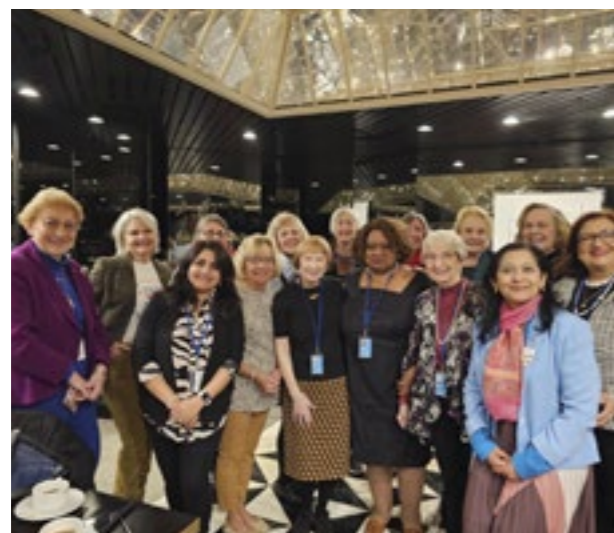
With members of the GWI family in New York