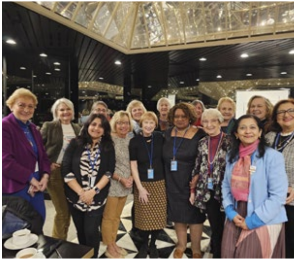
With members of the GWI family in New York