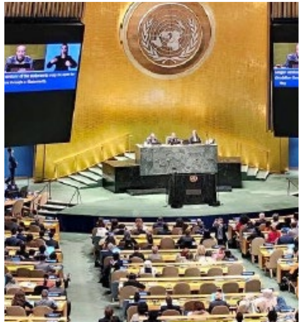
Opening session of CSW 67

Secretary General Antonio Guterres opened the event by outlining that, if we take account of women from all over the world, gender equality is still 300 years away. This opening set the scene for the rest of the conference by emphasising the work still required to achieve gender equality globally. A number of global presidents also made some key speeches, and the discussions continued to focus on gender equality in the digital age.